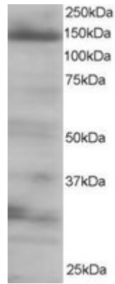
EB06230 staining (0.25µg/ml) of 293 lysate (RIPA buffer, 35µg total protein per lane). Primary incubated for 1 hour. Detected by western blot using chemiluminescence.