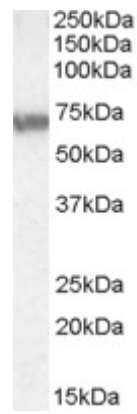
EB08711 (0.3 \mu g/ml) staining of Jurkat lysate (35 \mu g protein in RIPA buffer). Detected with chemiluminescence.