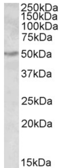
EB10130 (0.3 \mu g/ml) staining of Human Kidney lysate (35 \mu g protein in RIPA buffer). Primary incubation was 1 hour. Detected by chemiluminescence.