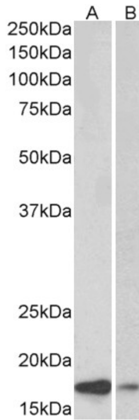
EB11713 (0.1 \mu g/ml) staining of Human Amygdala (A) and fetal Mouse (B) Brain lysate (35 \mu g protein in RIPA buffer). Detected by chemiluminescence.