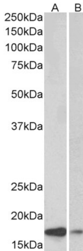
EB11713 (0.1 \mu g/ml) staining of Human Amygdala (A) and fetal Mouse (B) Brain lysate (35 \mu g protein in RIPA buffer). Detected by chemiluminescence.