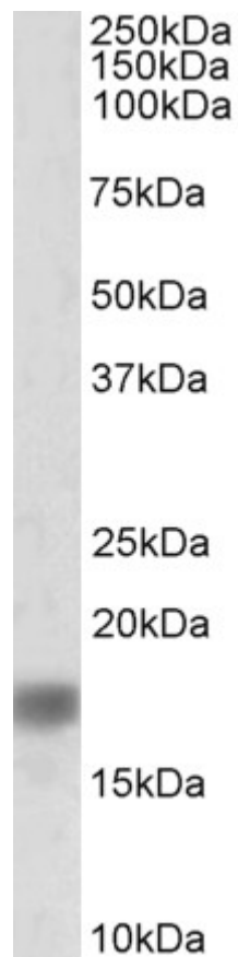
EB11714 (0.1µg/ml) staining of Human Amygdala lysate (35µg protein in RIPA buffer). Detected by chemiluminescence.