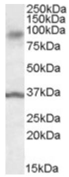
EB08835 (0.1µg/ml) staining of Human Substantia Nigra lysate (35µg protein in RIPA buffer). Detected by chemiluminescence.