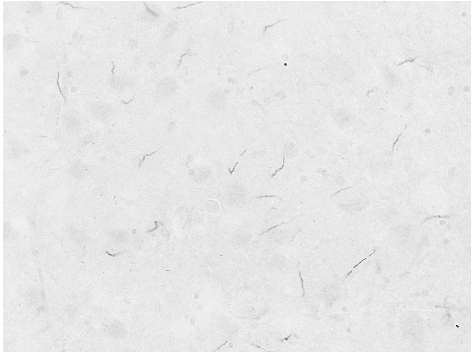
EB08631 (1:5000) immunostaining of ankyrin G-positive axon initial segments in cryosection of an immersion-fixed (1% PFA/0.5% methanol) Human Hypothalamus*. Antigen retrieval with citrate buffer Ph 6 at 80C for 30min. HRP-staining with Ni-DAB, after Biotin-SP-anti-goat (IgG) method. Data obtained by Drs. Éva Rumpler and Erik Hrabovszky, Inst, Exp, Med, Budapest, Hungary.