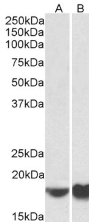
EB11622 (0.5 \mu g/ml) staining of NIH3T3 (A) and HeLa (B) lysates (35 \mu g protein in RIPA buffer). Detected by chemiluminescence.