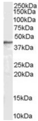
EB06745 (0.3 \mu g/ml) staining of Human Brain lysate (35 \mu g protein in RIPA buffer). Primary incubation was 1 hour. Detected by chemiluminescence.