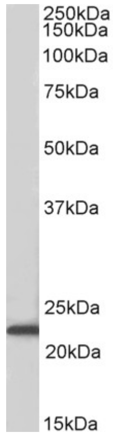
EB10633 (0.1 \mu g/ml) staining of Mouse Liver lysate (35 \mu g protein in RIPA buffer). Detected by chemiluminescence.