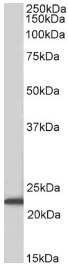
EB10633 (0.1 \mu g/ml) staining of Mouse Liver lysate (35 \mu g protein in RIPA buffer). Detected by chemiluminescence.