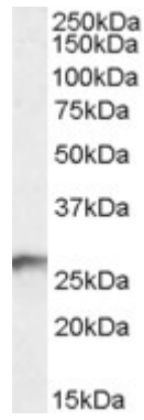
EB08290 (0.3µg/ml) staining of Human Kidney lysate (35µg protein in RIPA buffer). Detected by chemiluminescence.