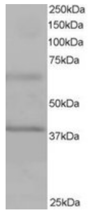
EB05200 staining (1 \mu g/ml) of Human Heart lysate (RIPA buffer, 35 \mu g total protein per lane). Primary incubated for 1 hour. Detected by western blot using chemiluminescence.