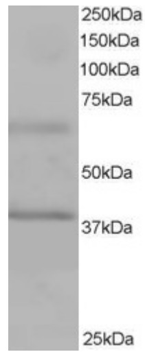
EB05200 staining (1 \mu g/ml) of Human Heart lysate (RIPA buffer, 35 \mu g total protein per lane). Detected by chemiluminescence.