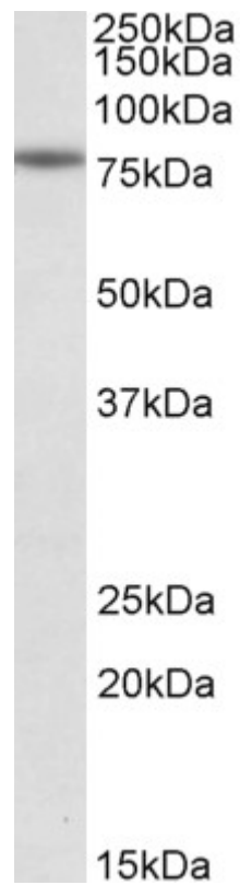
EB11988 (0.3 \mu g/ml) staining of Human Spleen lysate (35 \mu g protein in RIPA buffer). Detected by chemiluminescence.