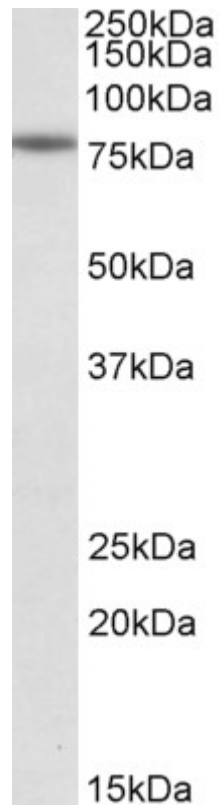
EB11988 (0.3 \mu g/ml) staining of Human Spleen lysate (35 \mu g protein in RIPA buffer). Detected by chemiluminescence.