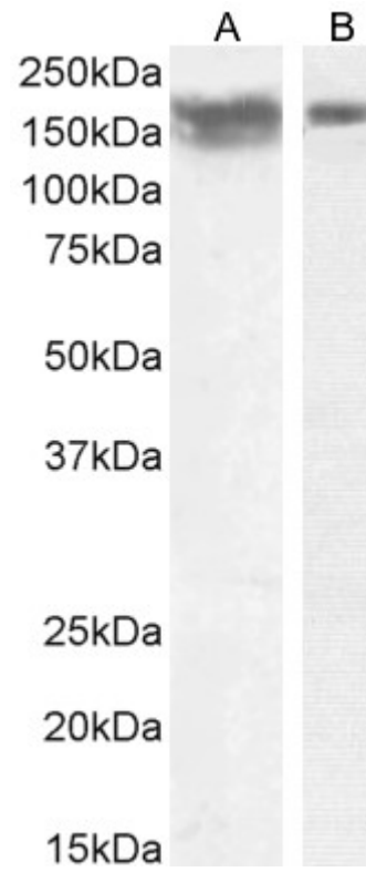
EB10948 (0.01 \mu g/ml) staining of Human Frontal Cortex (A) and (0.1 \mu g/ml) Cerebellum (B) lysate (35 \mu g protein in RIPA buffer). Detected by chemiluminescence.