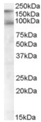
EB05267 (1µg/ml) staining of Human Colon lysate (35µg protein in RIPA buffer). Detected by chemiluminescence.