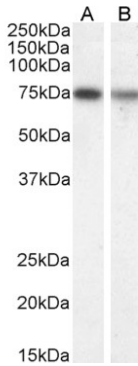
EB07255 (1 \mu g/ml) staining of Mouse (A) and Rat (B) Brain lysate (35 \mu g protein in RIPA buffer). Detected by chemiluminescence.