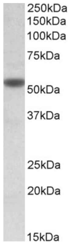
EB10968 (1 \mu g/ml) staining of KELLY lysate (35 \mu g protein in RIPA buffer). Detected by chemiluminescence.