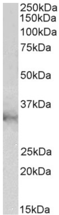
EB12398 (2 \mu g/ml) staining of U937 lysate (35 \mu g protein in RIPA buffer). Detected by chemiluminescence.