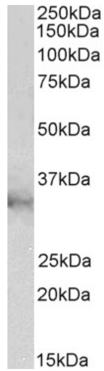
EB12398 (2 \mu g/ml) staining of U937 lysate (35 \mu g protein in RIPA buffer). Detected by chemiluminescence.