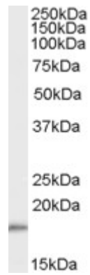
EB07914 (0.01µg/ml) staining of human muscle lysate (35µg protein in RIPA buffer). Primary incubation was 1 hour. Detected by chemiluminescence.