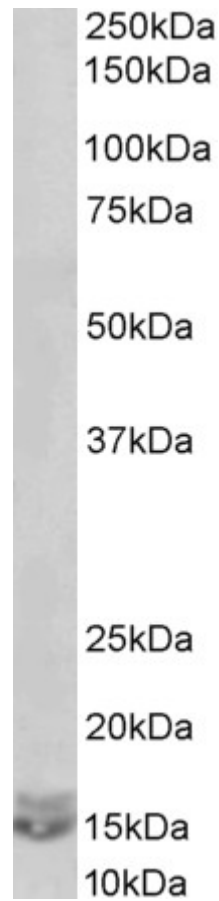
EB09352 (0.03µg/ml) staining of Daudi lysate (35µg protein in RIPA buffer). Primary incubation was 1 hour. Detected by chemiluminescence