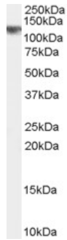
EB07719 (0.5 \mu g/ml) staining of Rat Brain lysate (35 \mu g protein in RIPA buffer). Primary incubation was 1 hour. Detected by chemiluminescence.