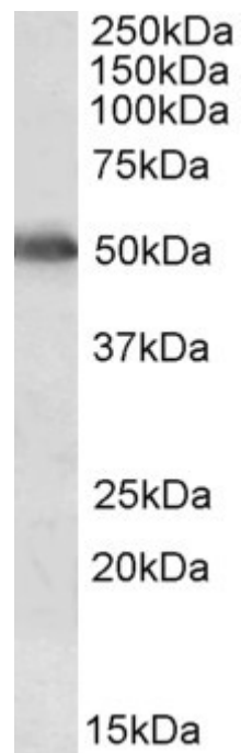
EB10355 (0.05 \mu g/ml) staining of Human Liver lysate (35 \mu g protein in RIPA buffer). Primary incubation was 1 hour. Detected by chemiluminescence.