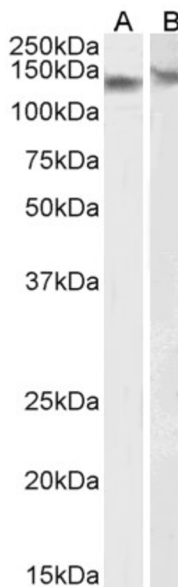
EB05033 (0.01 \mu g/ml) staining of NIH3T3 (A) and NSO (B) lysate. (35 \mu g protein in RIPA buffer). Detected by chemiluminescence.