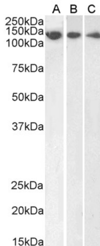
EB05033 (1 \mu g/ml) staining of HeLa (A), HepG2 (B) and Jurkat (C) lysate (35 \mu g protein in RIPA buffer). Detected by chemiluminescence.