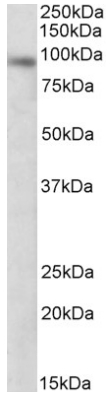
EB09706 (0.3 \mu g/ml) staining of NIH3T3 lysate (35 \mu g protein in RIPA buffer). Primary incubation was 1 hour. Detected by chemiluminescence.