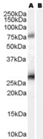
EB07292 (0.2µg/ml) staining of A431 lysate (35µg protein in RIPA buffer) with (B) and without (A) blocking with the immunising peptide. Primary incubation was 1 hour. Detected by chemiluminescence.