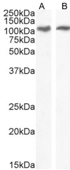
EB08559 (0.3µg/ml) staining of Human Duodenum (A) and (0.1ug/ml) Pancreas (B) lysate (35µg protein in RIPA buffer). Detected by chemiluminescence