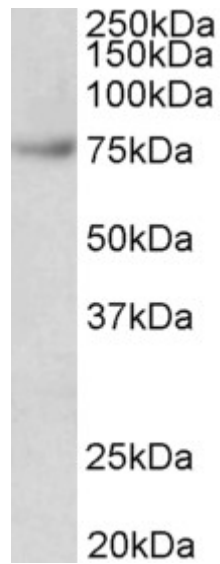
EB11620 (0.03 \mu g/ml) staining of Jurkat lysate (35 \mu g protein in RIPA buffer). Primary incubation was 1 hour. Detected by chemiluminescence.