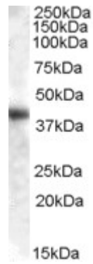
EB08213 (0.01 \mu g/ml) staining of Human Liver lysate (35 \mu g protein in RIPA buffer). Primary incubation was 1 hour. Detected by chemiluminescence.