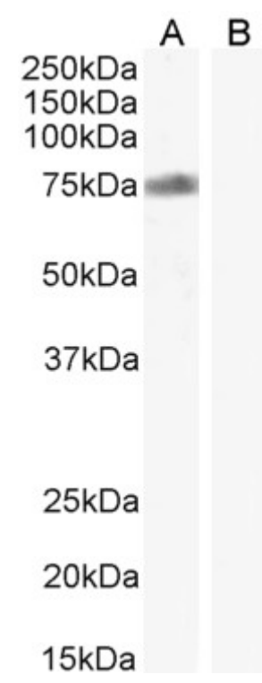
EB10581 (1μg/ml) staining of Mouse Spleen lysate (A) + peptide (B) (35μg protein in RIPA buffer). Detected by chemiluminescence.