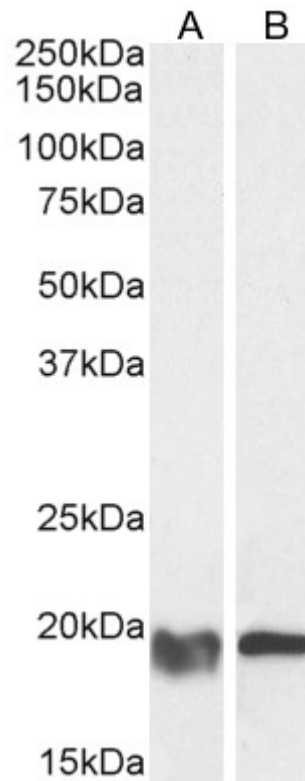
EB07316 (0.1ug/ml) staining of Human (A) and (1ug/ml) Rat (B) Kidney lysate. Detected by chemiluminescence.