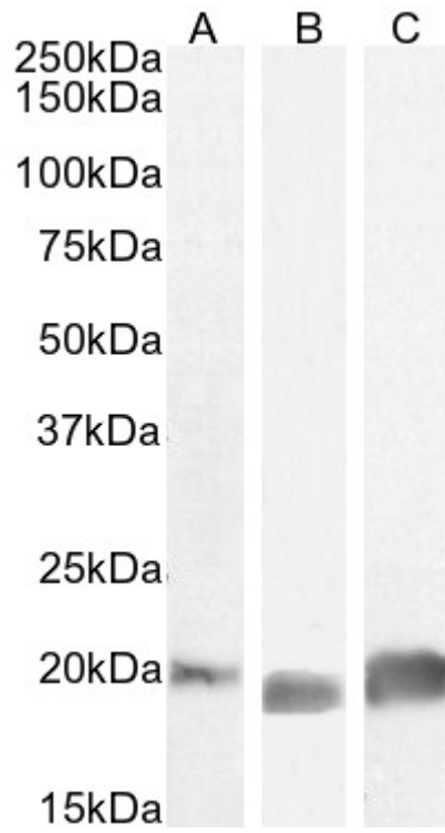
EB07316 (0.03ug/ml) staining of Human (A), Mouse (B) and (0.01ug/ml) Rat (C) Testes lysate. Detected by chemiluminescence.