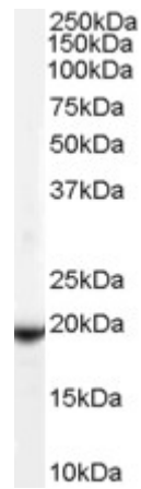
EB07316 (0.1µg/ml) staining of Human Testis lysate (35µg protein in RIPA buffer). Primary incubation was 1 hour. Detected by chemiluminescence.