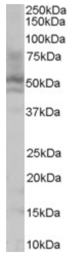
EB06700 (0.1µg/ml) staining of HepG2 lysate (35µg protein in RIPA buffer). Detected by chemiluminescence.