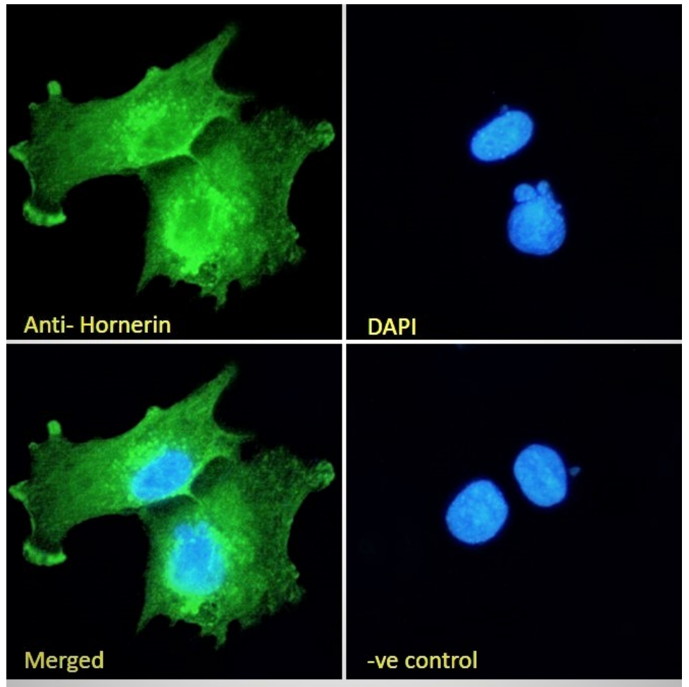
EB08267 Immunofluorescence analysis of paraformaldehyde fixed U251 cells, permeabilized with 0.15% Triton. Primary incubation 1hr (10ug/ml) followed by Alexa Fluor 488 secondary antibody (2ug/ml), showing cytoplasmic and plasma membrane staining. The nuclear stain is DAPI (blue). Negative control: Unimmunized goat IgG (10ug/ml) followed by Alexa Fluor 488 secondary antibody (2ug/ml).