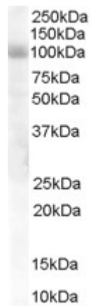
EB06624 staining (1µg/ml) of Human Lung lysate (RIPA buffer, 30µg total protein per lane). Detected by chemiluminescence.