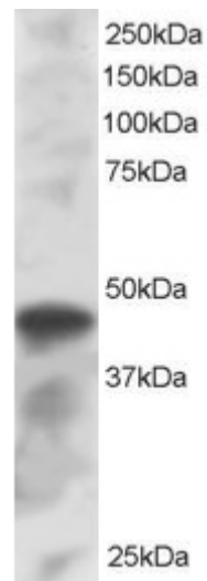
EB05586 staining (1 \mu g/ml) of K562 lysate (RIPA buffer, 30 \mu g total protein per lane). Primary incubated for 1 hour. Detected by western blot using chemiluminescence.