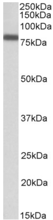
EB10697 (0.3 \mu g/ml) staining of nuclear NIH3T3 lysate (35 \mu g protein in RIPA buffer). Primary incubation was 1 hour. Detected by chemiluminescence.