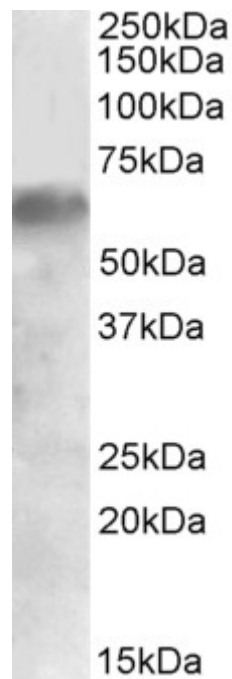
EB10698 (0.5 \mu g/ml) staining of Human Liver lysate (35 \mu g protein in RIPA buffer). Primary incubation was 1 hour. Detected by chemiluminescence.