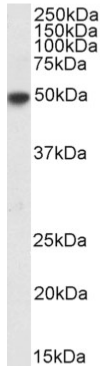
EB11330 (0.5 \mu g/ml) staining of NIH3T3 cell lysate (35 \mu g protein in RIPA buffer). Detected by chemiluminescence.