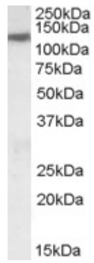
EB08090 (0.1 \mu g/ml) staining of Human Heart lysate (35 \mu g protein in RIPA buffer). Primary incubation was 1 hour. Detected by chemiluminescence.