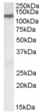
EB08090 (0.1µg/ml) staining of Human Heart lysate (35µg protein in RIPA buffer). Primary incubation was 1 hour. Detected by chemiluminescence.