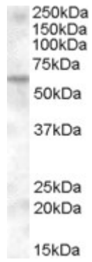
EB08538 (0.1 \mu g/ml) staining of Human Muscle lysate (35 \mu g protein in RIPA buffer). Primary incubation was 1 hour. Detected by chemiluminescence.