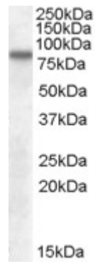
EB09295 (0.1µg/ml) staining of Human Cerebral Cortex lysate (35µg protein in RIPA buffer). Detected by chemiluminescence.