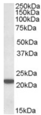
EB09445 (0.01µg/ml) staining of Human Liver lysate (35µg protein in RIPA buffer). Detected by chemiluminescence.