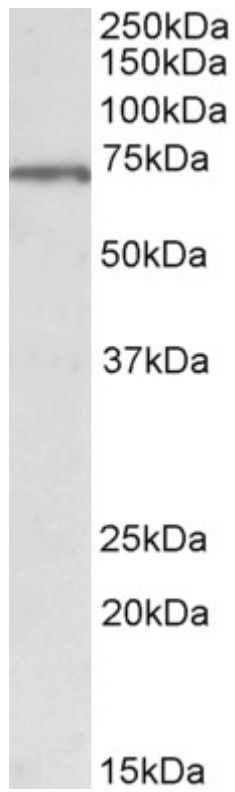
EB11998 (1µg/ml) staining of Human Hippocampus lysate (35µg protein in RIPA buffer). Detected by chemiluminescence.