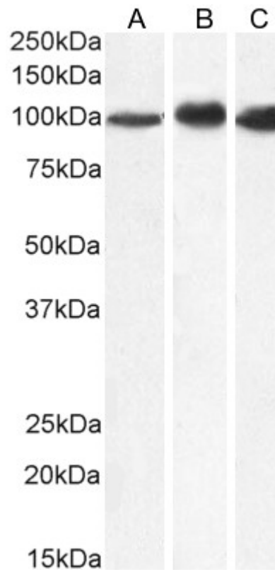
EB08489 (1µg/ml) staining of Jurkat (A), MCF7 (B) and (2ug/ml) MOLT4 (C) cel lysate (35µg protein in RIPA buffer). Detected by chemiluminescence.