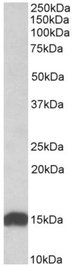
EB09788 (0.01 \mu g/ml) staining of Human Heart lysate (35 \mu g protein in RIPA buffer). Detected by chemiluminescence.