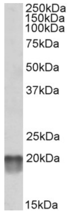
EB010191(0.1 \mu g/ml) staining of Human Heart lysate (35 \mu g protein in RIPA buffer). Detected by chemiluminescence.