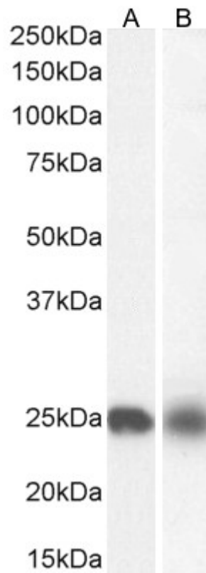
EB10193 (0.5 \mu g/ml) staining of Rat Heart (A) and (2 \mu g/ml) Rat Brain (B) lysate (35 \mu g protein in RIPA buffer). Detected by chemiluminescence.